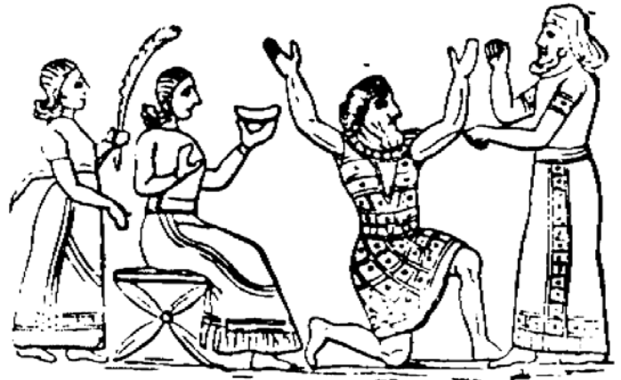
Woman with cup ** from Babylon.—(KITTO'S Biblical Cyclopaedia .)